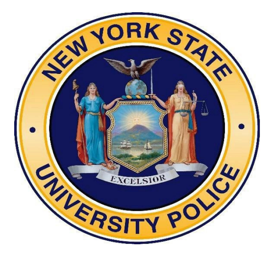
Issued September 25, 2023