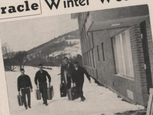
MOVING DAY —Four students carry their clothing up the hill from Brookside to Dorm B, which was inaugurated for the first time on Saturday, Jan. 5.

A January thaw will be followed by a blizzard! campus organizations are to up traditional snow sculptures for Winter Weekend, Jan. 18-19. Things look better this year, though, when the snow is bare. If it snows, the sculptures still not be the towering things of some past years. Student Senate has a height to 15 feet. Tri-Atelier again the weekend. The Sculptors and Student Union anticipate. The Players will Broadway come Gold Cadillac, Jan. 25, 4 p.m. On Sunday Student Union movie, "The Story." Saturday sculpture awarding that evening. There will be